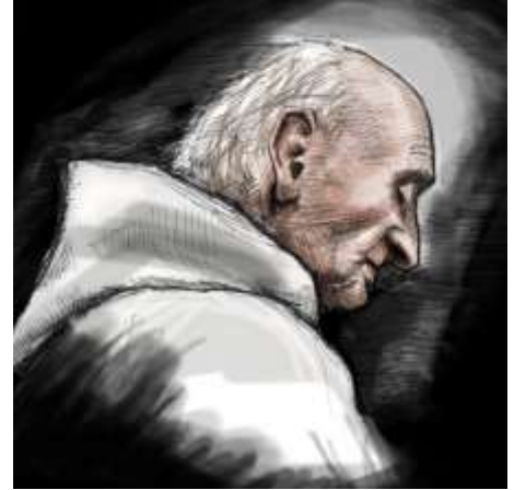
Fr Jacques Hamel, martyred in France while offering Mass, July 26, 2016. “Fr Hamel, pray for us and for the conversion of Muslims.”

shrewd decision on his part to forbid his followers to read the Old and New Testaments, lest these books convict him of falsity. It is thus clear that those who place any faith in his words believe foolishly.